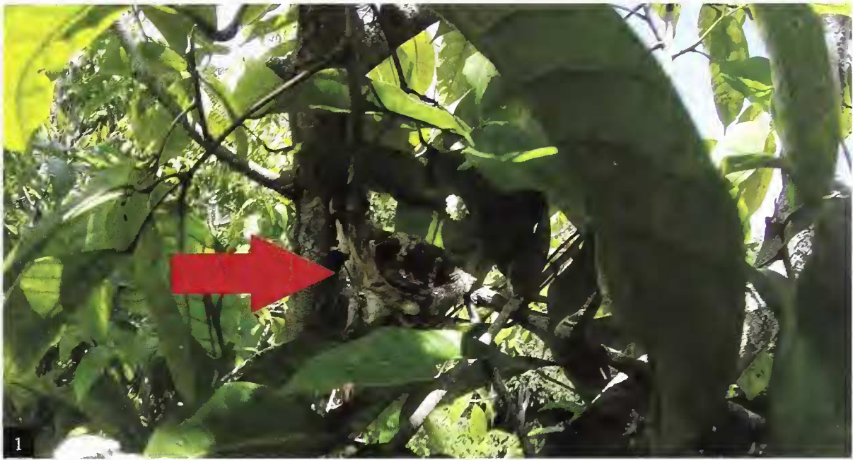
Figure 1. Spotted Tanager Tangara punctata nest in the canopy of a Protium heptaphyllum tree, Museu da Amazônia, Manaus, Amazonas, Brazil, February 2016 (Tomaz Nascimento de Melo)